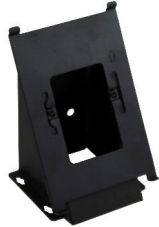
Mounting Wedge (x1)